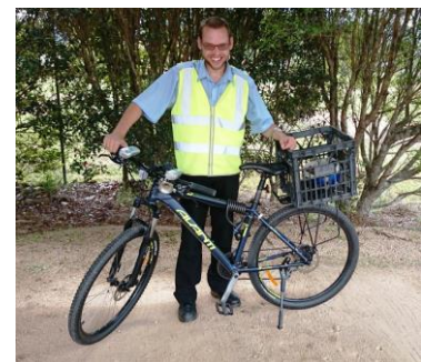
and his new Avanti bike!